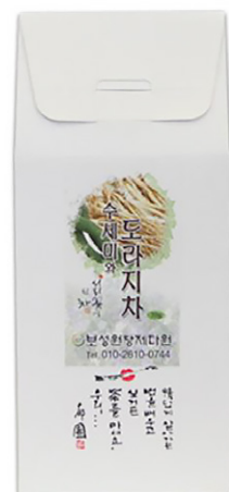
Vegetable Sponge & Balloon Flower Tea Herbal Tea