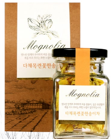
Dache Herbal Tea

* Detailed product information and the pricelist are available upon request.