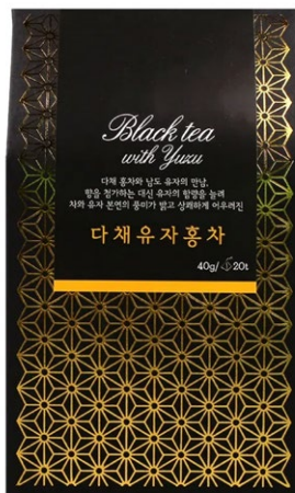
Dache Tea For All