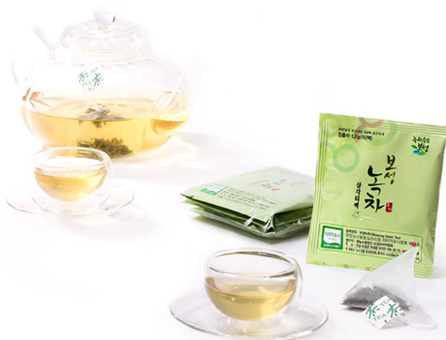
Premium Green Tea Ujeon