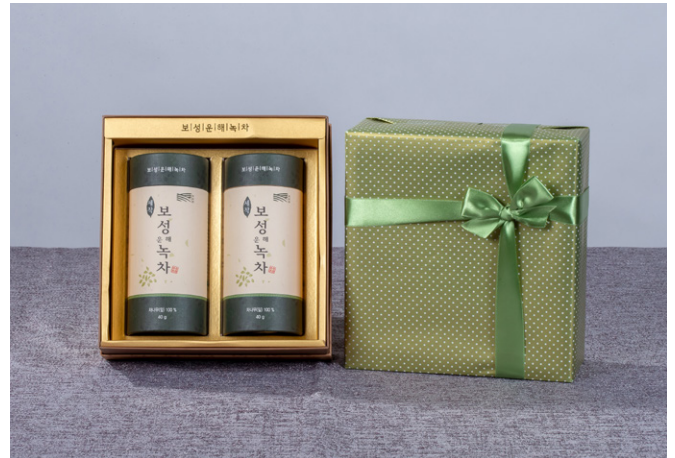
Second Flush Green Tea Sejak