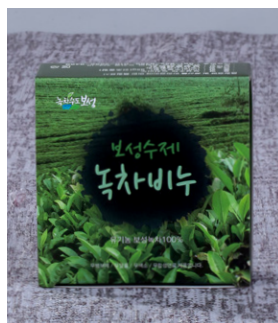
Green Tea Soap