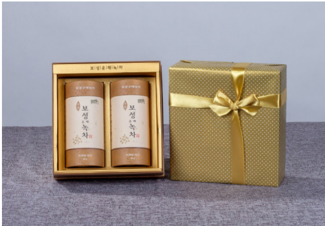
First Flush Green Tea Ujeon