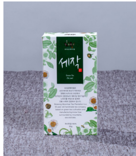
Green Tea (Sejak) Value Pack