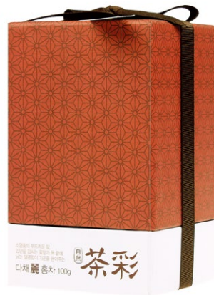
Dache Master's Black Tea