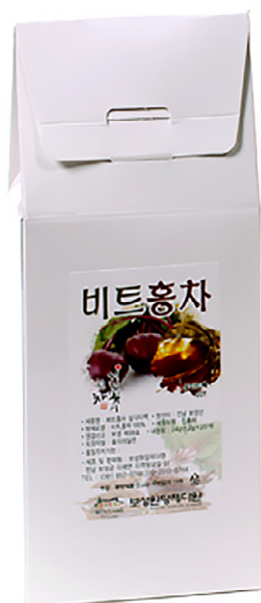
Beetroot Black Tea