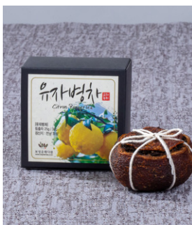
Citron Tea (Bottle)