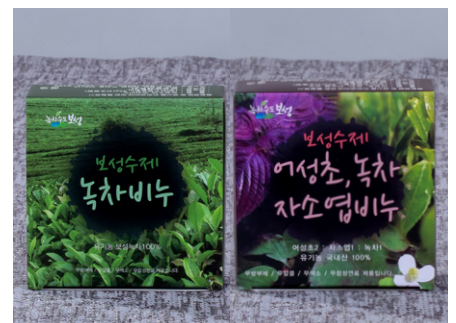
Woonhae Green Tea Soap Set