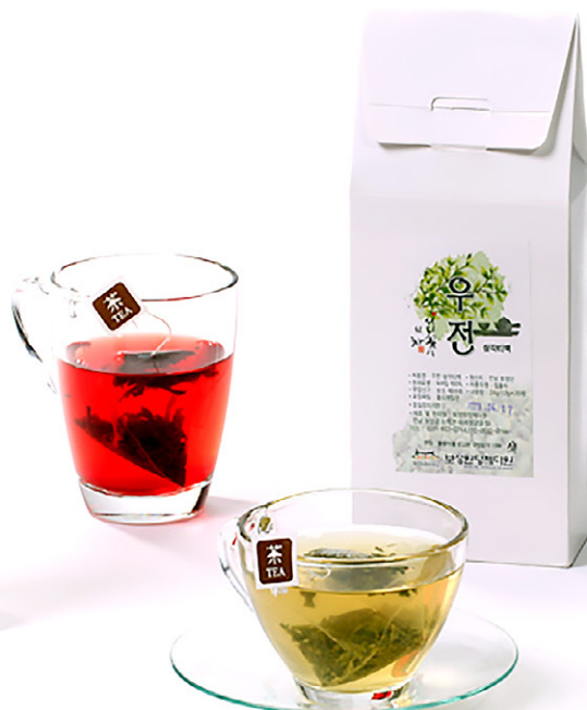
Premium Green Tea Ujeon