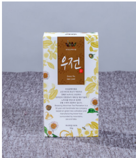
Green Tea (Ujeon) Value Pack