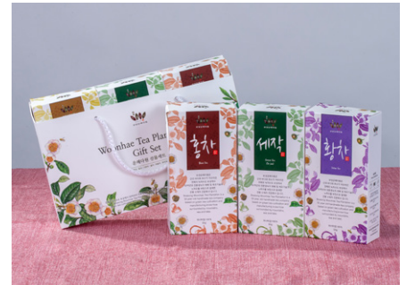
Woonhae Tea Set