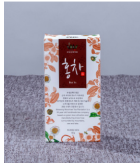
Black Tea Value Pack