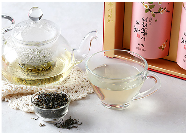
Frost Flower Tea premium green tea