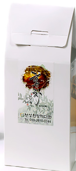
Premium Black Tea First Flush