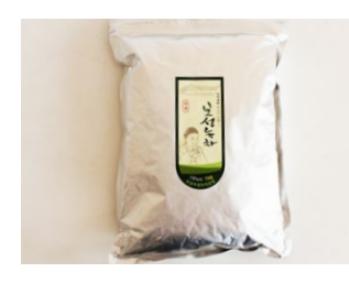
green tea powder 1 kg