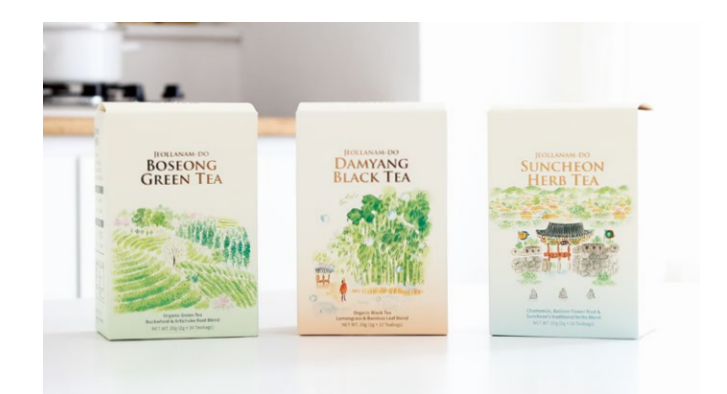
Jullanamdo tea blends