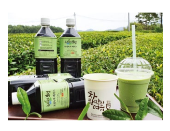
Boseong green tea base for cafe 1ℓ