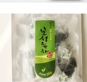
Boseong first flush green tea 24 g