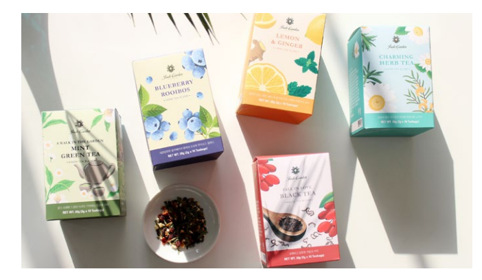
Jade Garden tea blends