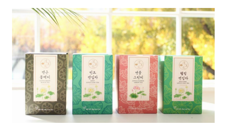
Semiwon tea blends