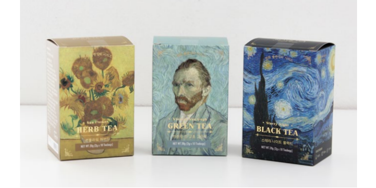
Gogh exhibition tea blends